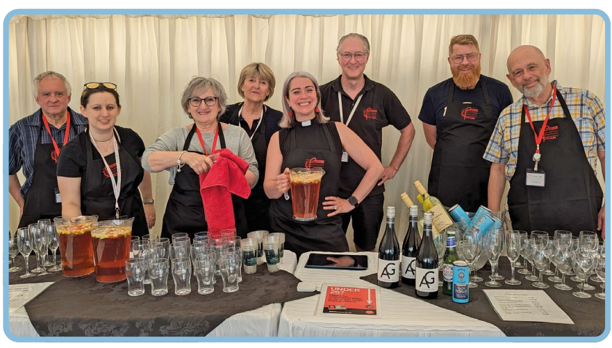
The refreshments team