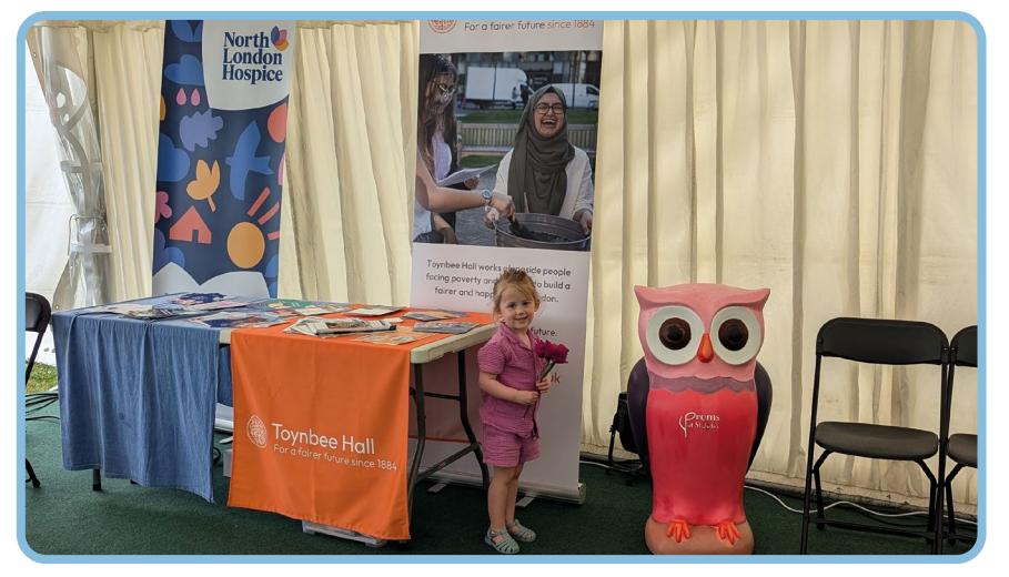
A young supporter with our sponsored North London Hospice owl