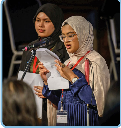
Peer researchers from Toynbee Hall address Proms audience