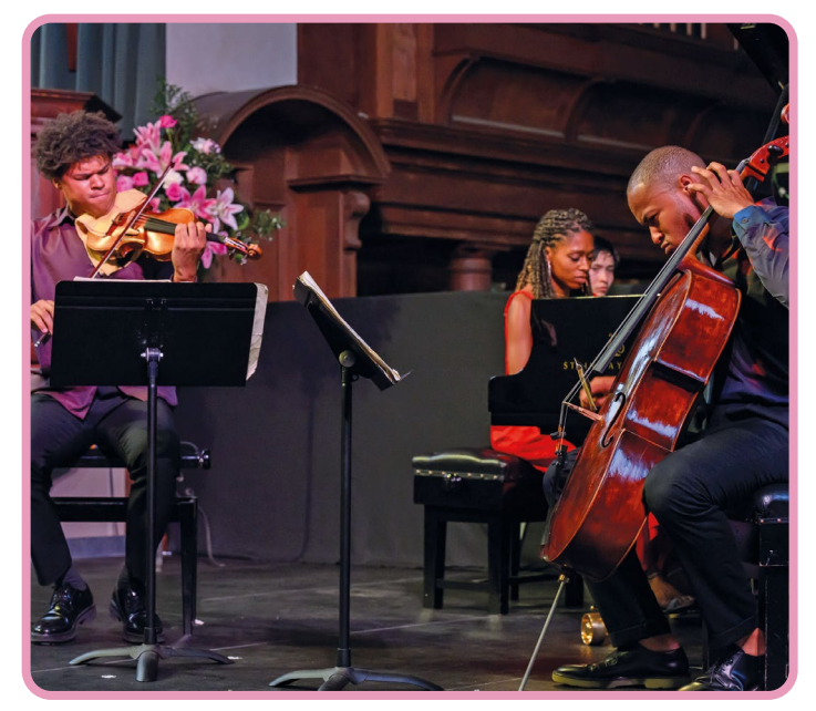
Kanneh-Masons and Friends