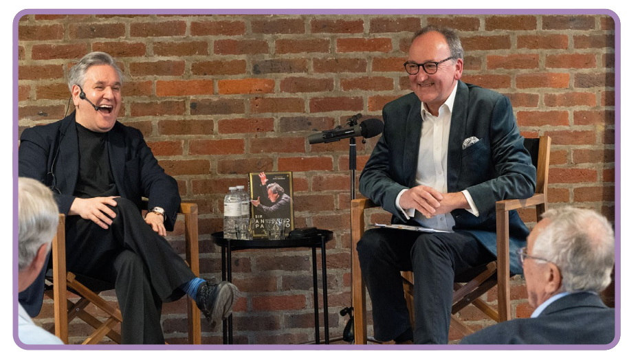
Sir Antonio Pappano in conversation with Ian Skelly